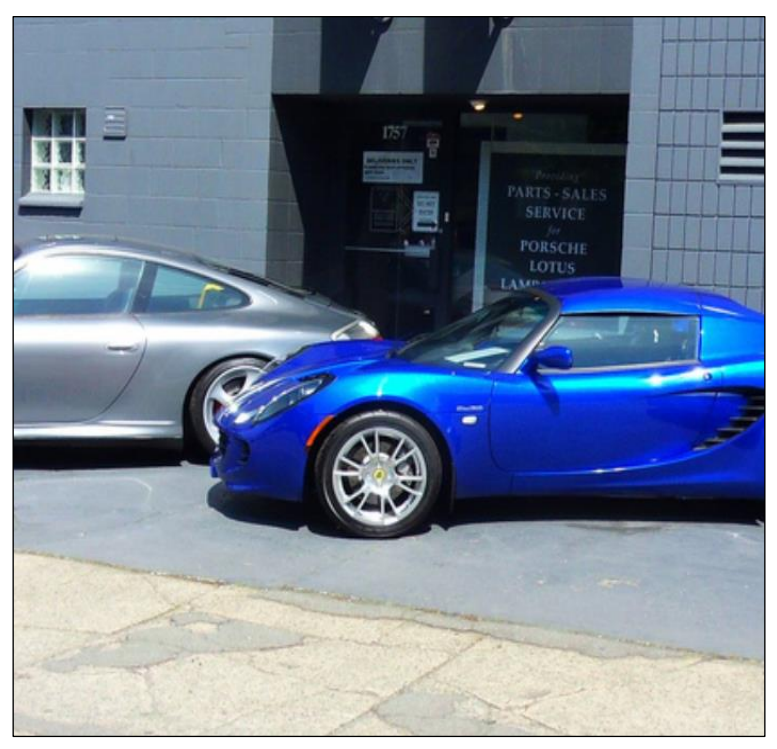
A silver car and a blue car.

In 2017, black was the most popular colour of new cars purchased according to the Society of Motor Manufacturers and Traders. More than half a million black cars, 1 in 5 of all new sales, were sold last year. White was the most popular colour in 2016, but is now in third place, with grey in second.