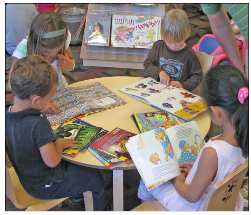
Pictured: Children reading their own books.

Do you think this is replacing the role of adults? Let us know!