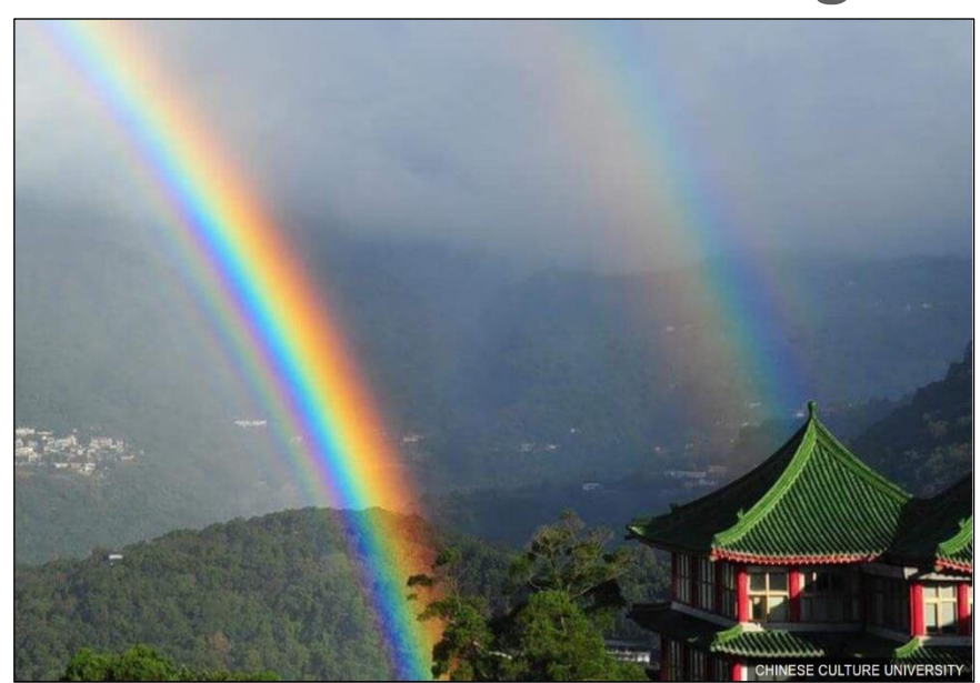
The 8hr 58min rainbow in Taiwan in China.

A rainbow may be a wondrous sight but for most people it's also a fairly fleeting one.