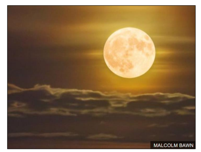
Malcolm Bawn's photo of the moon pictured from North Shields.

Last weekend's "supermoon" was the last opportunity to see one in 2017. A supermoon is a new or full moon which occurs with the moon at or near its closest approach to Earth in a given orbit. The scientific event is uncommon, as it only occurs around every 14 full moons. The last one occurred on November 14<sup>th</sup> 2016, when the moon appeared up to 14 per cent bigger and 30 per cent brighter than normal. Sunday's brighter and larger than normal moon gets its name "Full Cold Moon," for a reason that's much more obvious than you may realise, but it's very fitting. The Cold Moon gets its name because December is the month when it really starts to get cold, according to NASA.