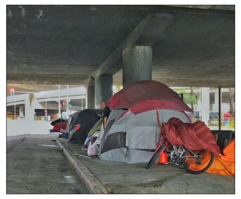
Tents pictured under a bridge inhabited by homeless people.

In York, the city council were unpopular in 2015 when 5,400 people signed a petition backing the removal of bars on benches amid claims they too were "anti-homeless".