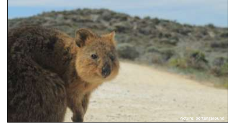
Quokka pictured in Australia.

with its mother and another adult. The Northcliffe fire burned some 98,000 hectares, making it the biggest bushfire in Western Australia since 1960.