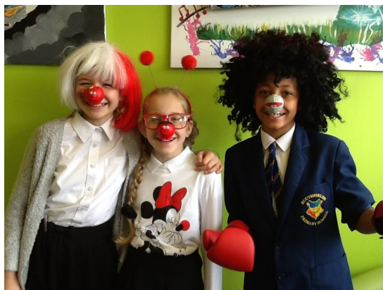
Even in Year 6 there was time for fun!

We wore something to make people smile and gave a £1 donation.