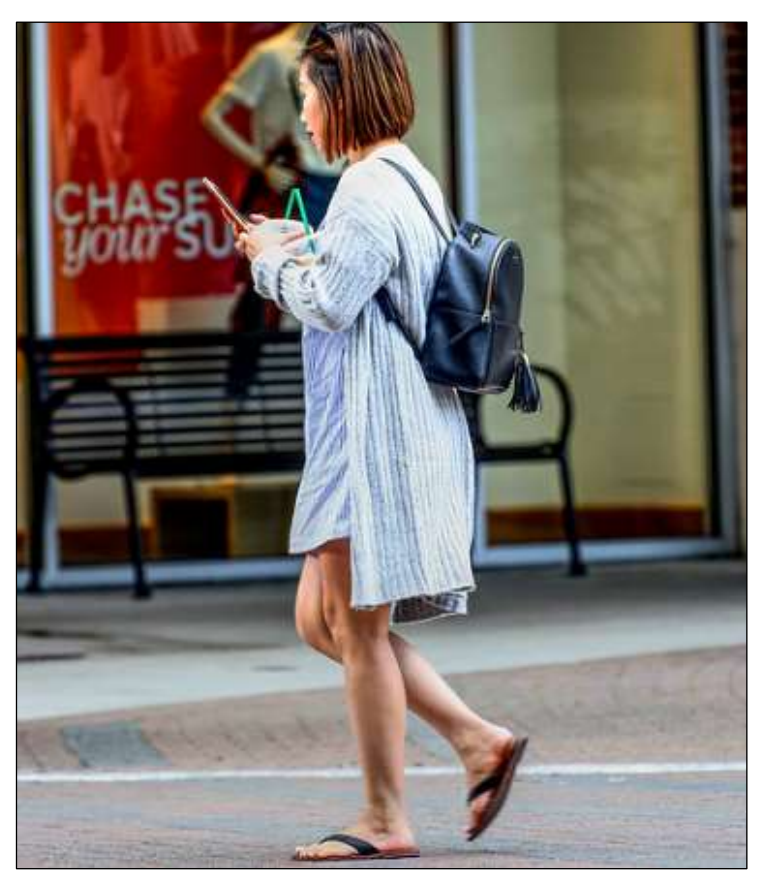
Pictured: A person walking and texting.

Road signs need to be placed on the ground to guide "zombie pedestrians" glued to their phones, a government transport adviser has said.