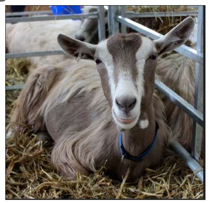
Pictured: A typical goat.

A new study conducted by research scientists at the Queen Mary University of London has found that goats can tell the difference between a smiling human face and a sad or grumpy one. They prefer the smiling happy face! Photos of happy and sad people's faces were shown to goats at the Buttercups Sanctuary for Goats in Kent. The goats spent longer interacting with the happy faces going straight over to them and nuzzling them. The 20 goats tested in the study spent 50% longer with the grinning faces.