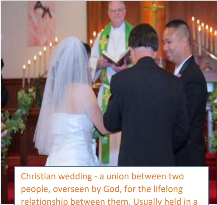
Christian wedding - a union between two people, overseen by God, for the lifelong relationship between them. Usually held in a church.

Look at the images of the different types of weddings and relationships. Talk about some of the things you think the different relationships have in common.