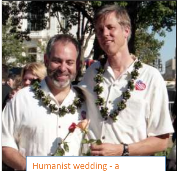
Humanist wedding - a ceremony that isn't religious and gives people the opportunity to marry where they want, when they want and how they want.