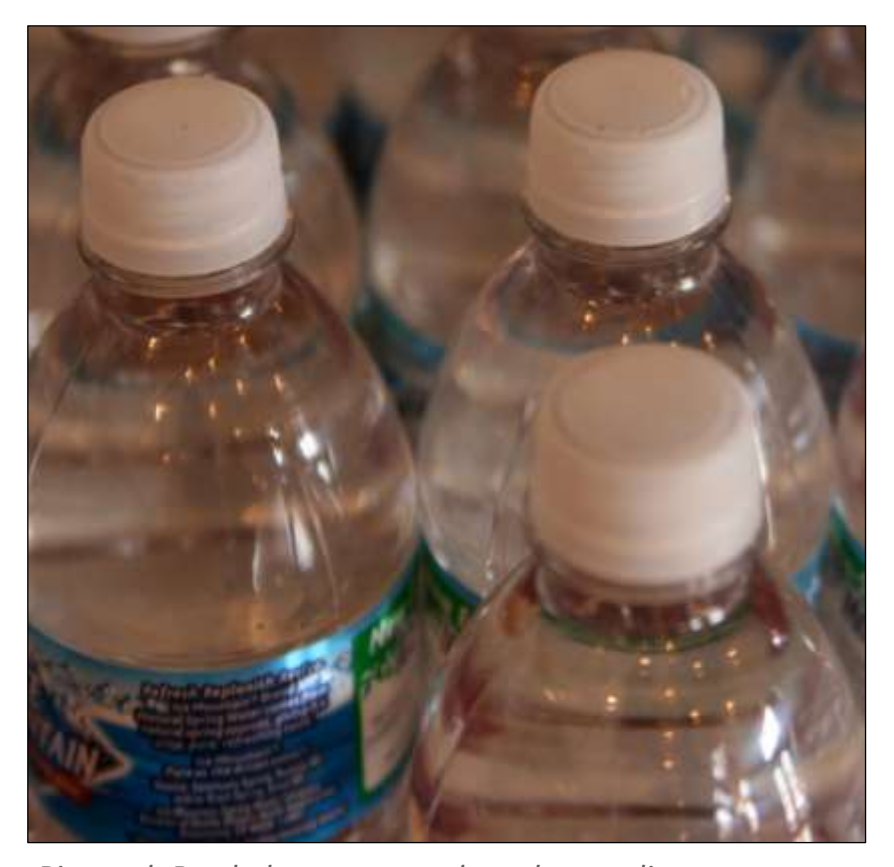
Pictured: Bottled water many have been reliant on.

Many people across the south-east and south-west of the UK have faced further issues following heavy snow fall, with thousands of houses having their water cut off completely. Water suppliers said the speed in which the heavy snow melted and the temperatures increased led to burst water mains and leaks.