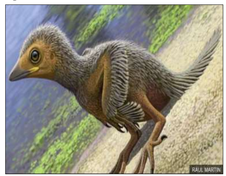
Pictured: What the bird might have looked like.

The bird is thought to have had teeth and clawed fingers on each wing and looked a lot like modern day birds of today.