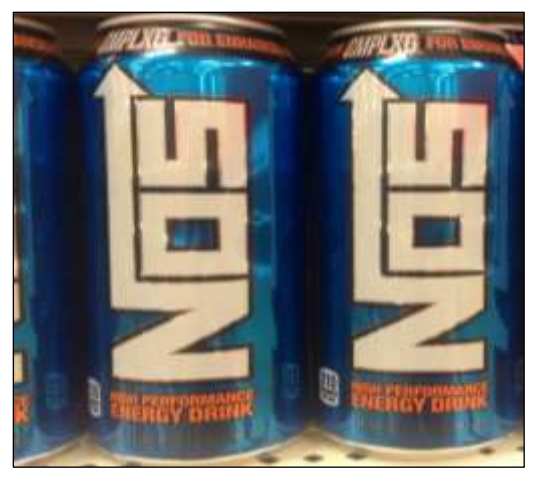
Pictured: Typical energy drink.

Sales of energy drinks to children under 16 have been banned in most supermarkets because of worries about high levels of sugar and caffeine. Supermarkets including Asda, Waitrose, Tesco and the Co-op are banning the drinks as is the pharmacy chain Boots.